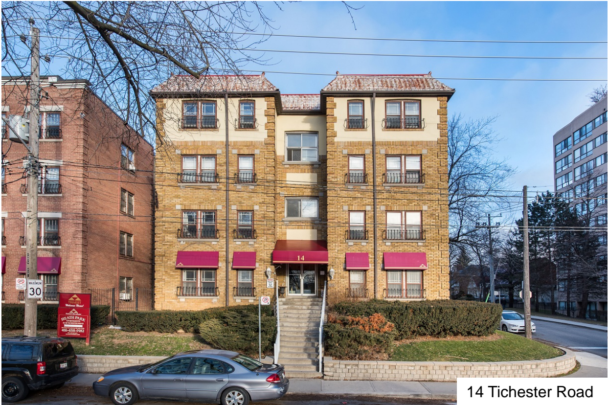
14 Tichester Road